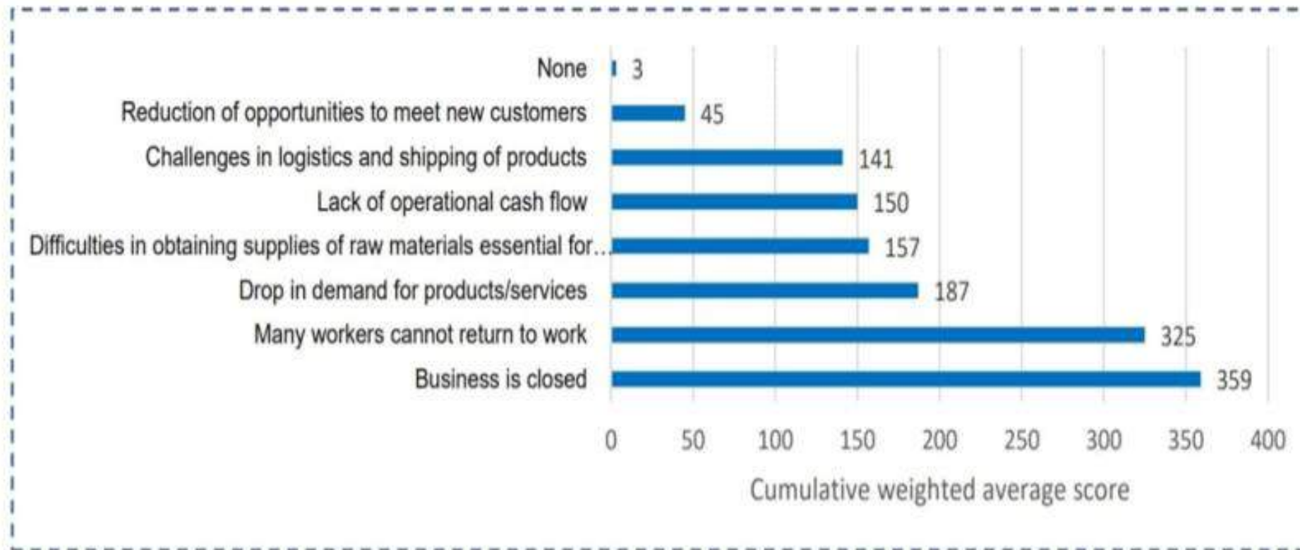
Reasons for Slowdown of Economic Activity due to COVID-19